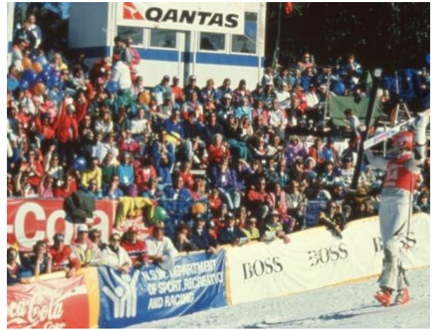
Slalom skier Armin Bittner (West Germany) celebrates his slalom win