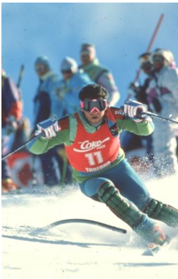
Crowd favourite Alberto Tomba (Italy)