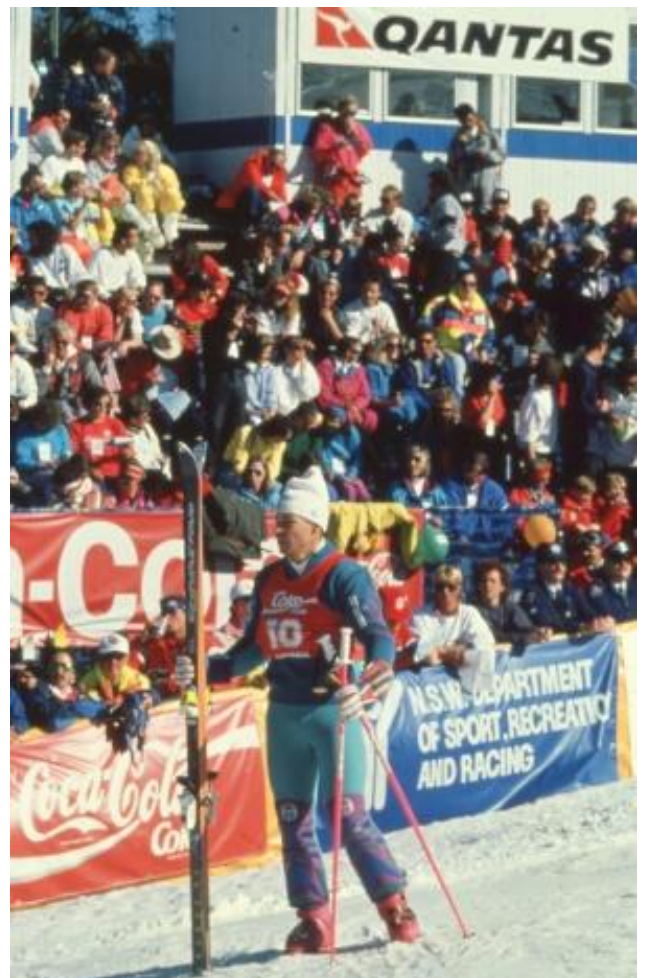
Marc Girardelli (Luxemburg) awaits the results of his giant slalom run