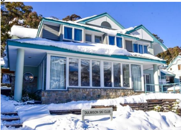
Dulmison Lodge 2018