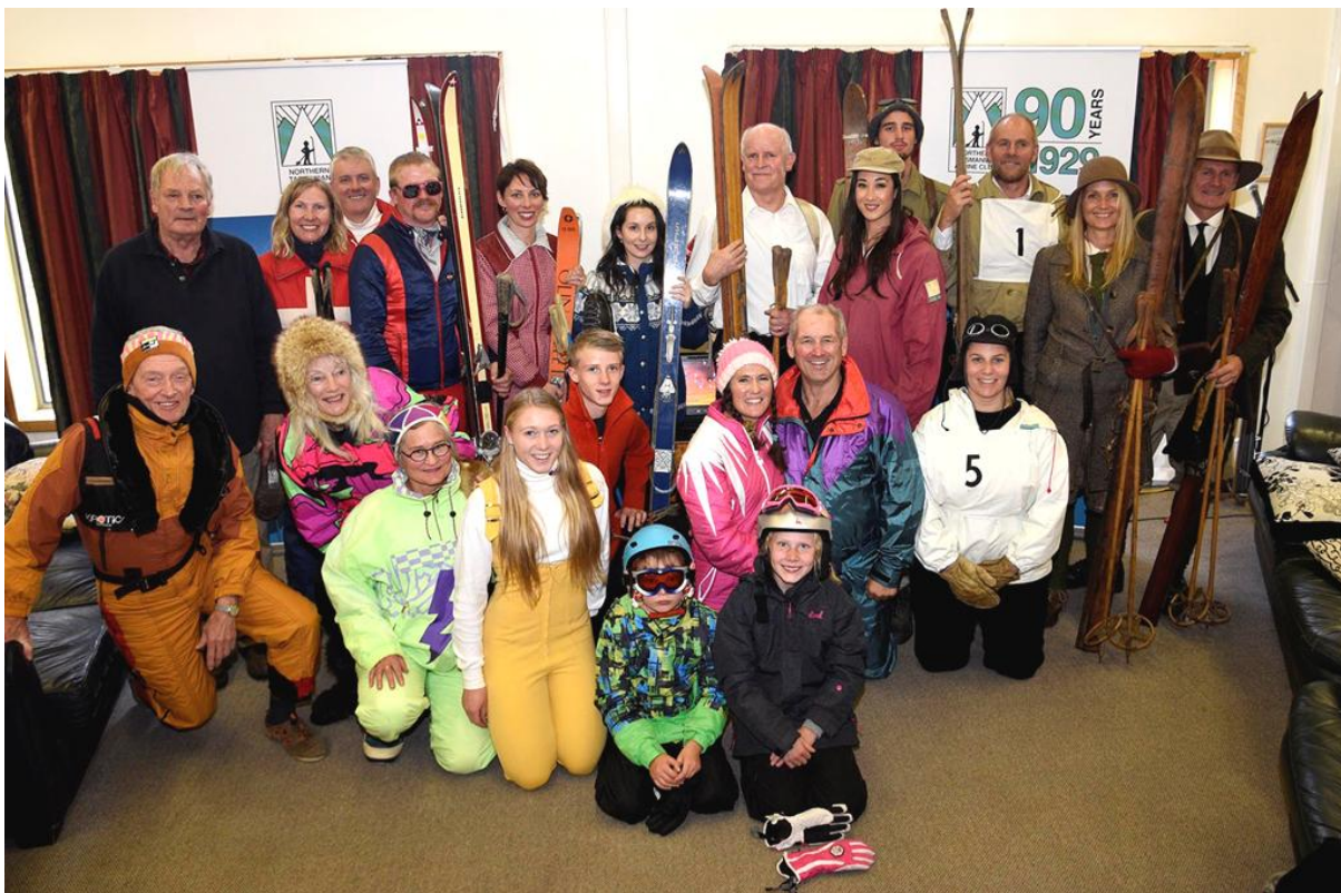
The mannequins at the AASH Conference Dinner